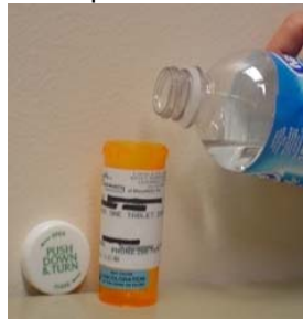
Mix with water and coffee grinds, cat litter, or dirt