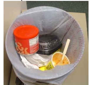
Hide in the trash

Do NOT dispose of medication down the drain or toilet.